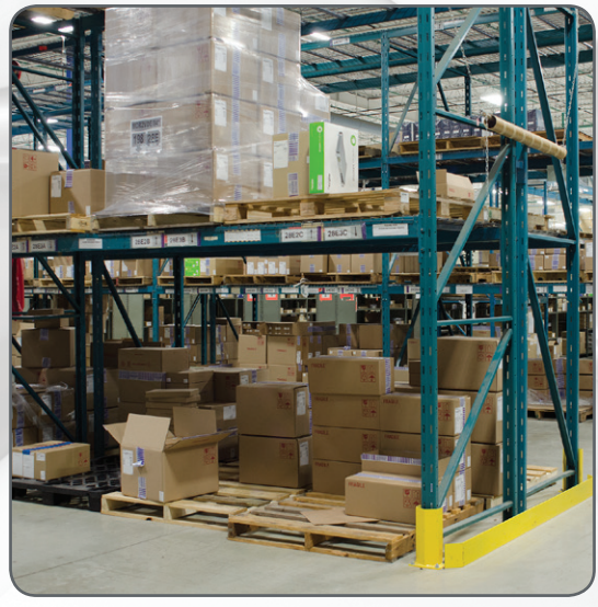
Our comprehensive distribution channel ensures products reach OEMs and integrators in a timely manner.