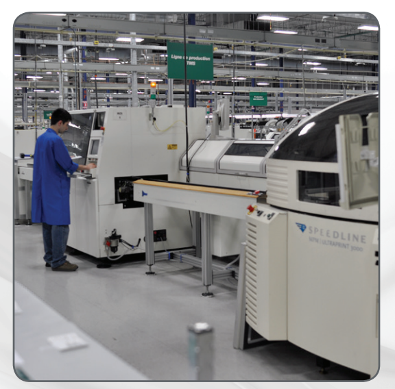
Matrox Imaging prides itself on world-class production whether carried out in-house or outsourced.