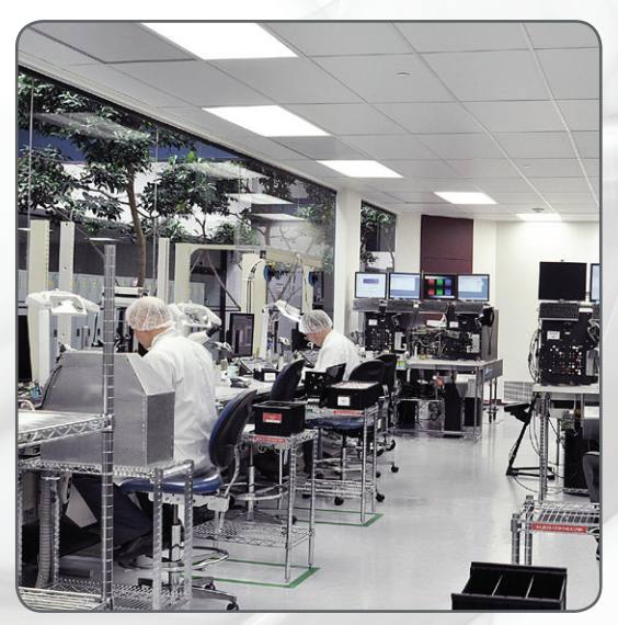
Strict adherence to industry best practices—including a specially designed on-site clean room—ensures all hardware manufacturing and software development meets the highest standards.