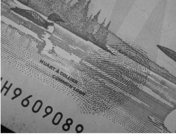
Figure 1 Image of fingerprint on currency.