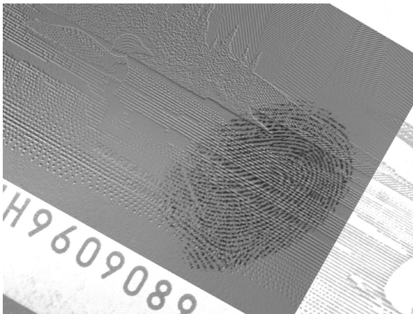
Figure 4 Image of fingerprint after subtraction.